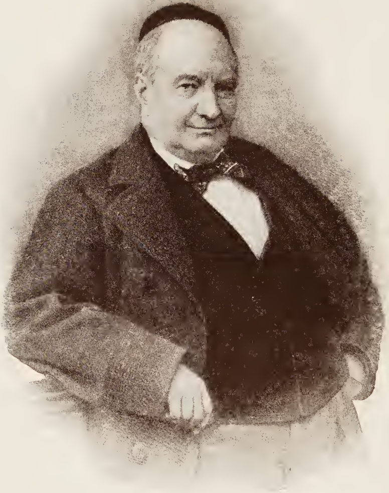
G. A. Sainte-Beuve